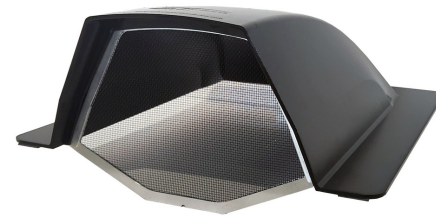
Side Wall Intake