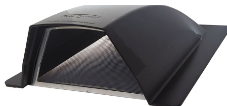
Flat Wall Intake